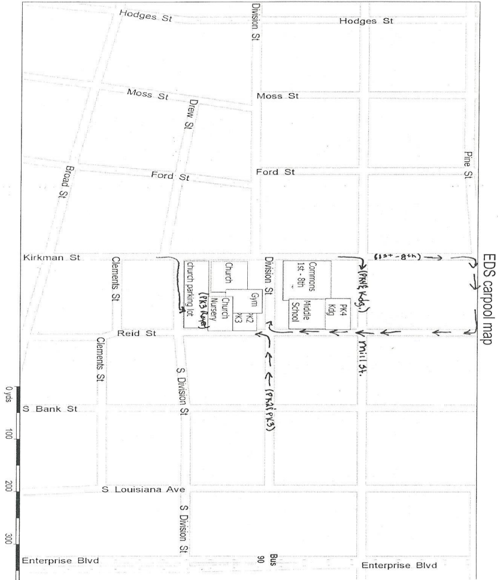
EDS carpool map